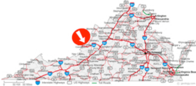
Ideally located near I-64 in Covington, Virginia

920 South Craig Avenue - Covington, Virginia 24426