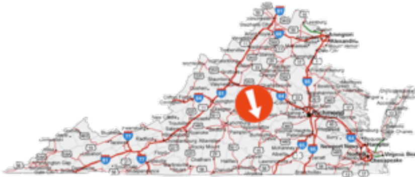
On Route 460 next to new Super Wal-mart.

Route 460 West - Appomattox, Virginia 24522