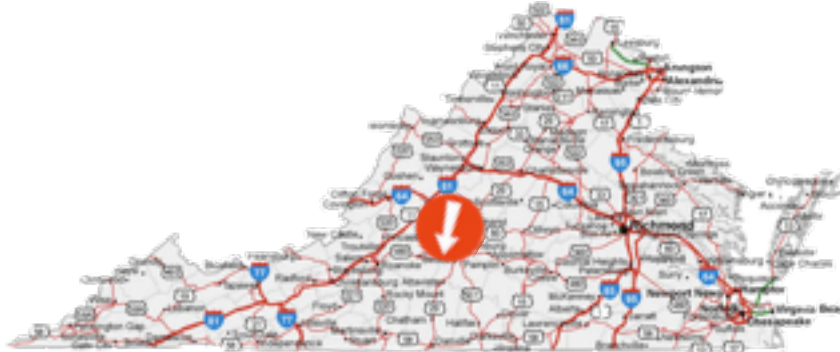
Conveniently located near downtown Bedford

554 Blue Ridge Avenue Bedford, Virginia 24523