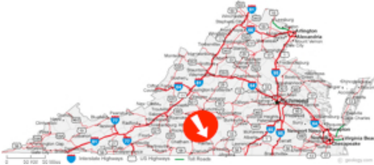
Food Lion Anchored Center on Halifax Road

3130 US Hwy 501 South - South Boston, Virginia 24592