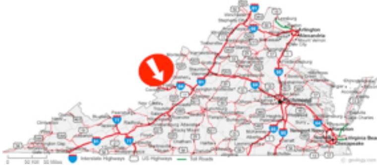
Ideally located near I-64 in Covington, Virginia

920 South Craig Avenue - Covington, Virginia 24426